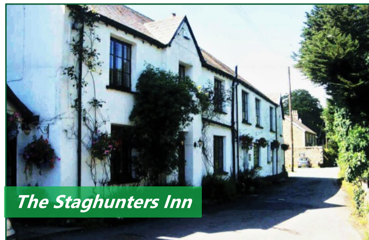
The Staghunters Inn

Situated in the heart of the Exmoor National Park, The Staghunters Inn is a family owned and run establishment. Nestled on the banks of the River Lyn in an ideal location for exploring an area of outstanding natural beauty The Staghunters welcomes guests from across the county.