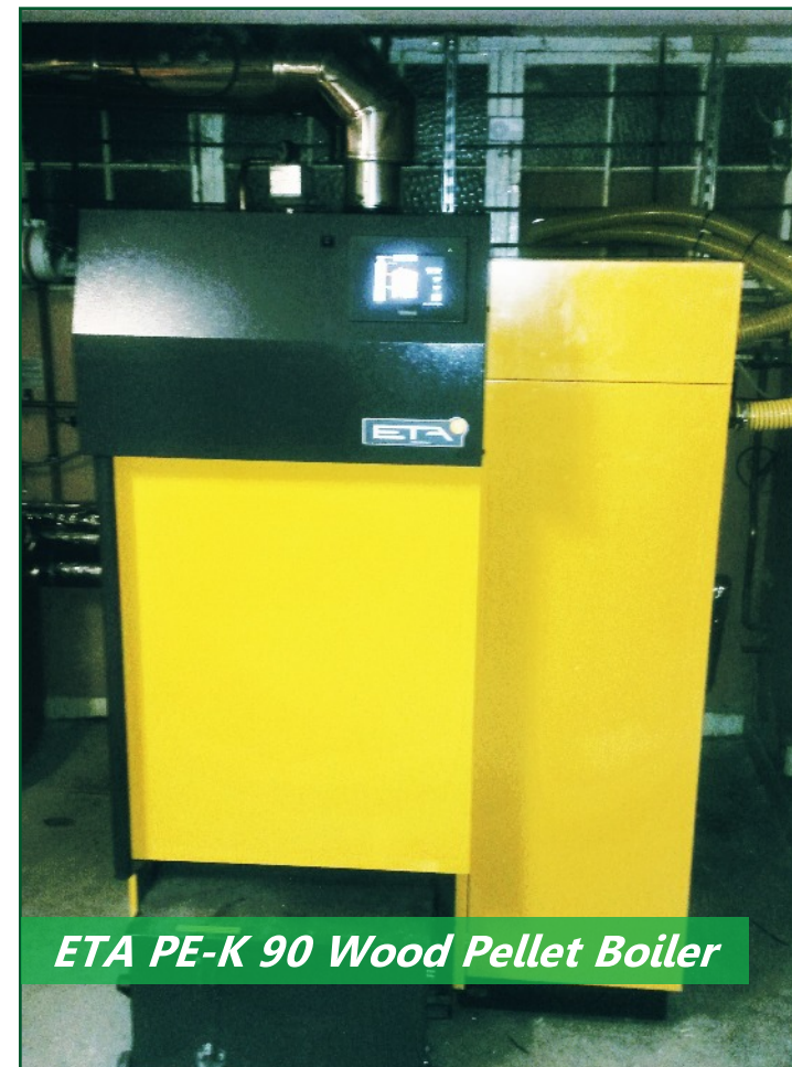
ETA PE-K 90 Wood Pellet Boiler

We constructed a 7 tonne Wood Pellet store and 2000 litre thermal store on site, all to RHI regulations, and we were able to assist Mr. Wyburn with Heat Meter reports and the final RHI application submission.